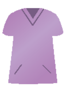
Female Healthcare Assistant